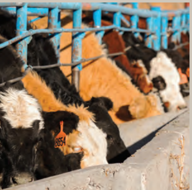
Livestock and Range