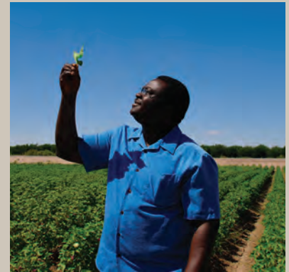
Task Force Reports