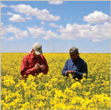
Weather and Climate